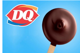
Kaycee Pickup March 7th