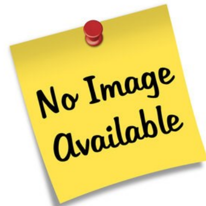
Caitlin Coates April 13th